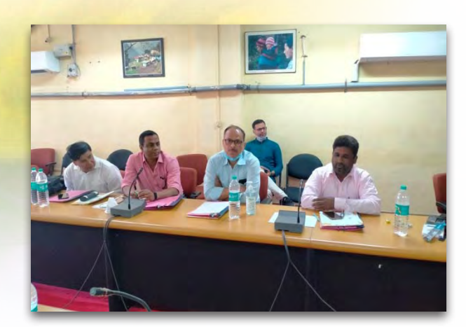
Experts deeply engaged during the programme